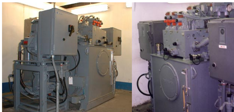
Bosch Rexroth hydraulic power units operate the miter gate cylinders. Each cylinder is operated by one power unit.

Previously the control room operators utilized a mechanical