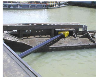
The hydraulic cylinder is attached to the miter gate. Bosch Rexroth's black Ceramax piston rod coating helps protect against corrosion.

According to Louis Prieto, Rexroth systems engineer, one condition for replacement of the old mechanical drives was that the new hydraulic cylinder assemblies interfaced with the original strut anchor on the miter gates and adapted to the original machinery foundation. In addition to hydraulic power units and cylinders, Rexroth