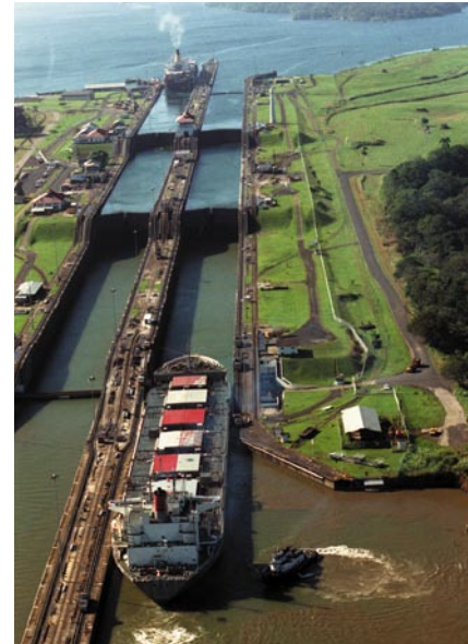
Ships from all over the world use the Panama Canal every day. Bosch Rexroth helped improve the Canal's throughput by providing a new hydraulic system that replaced the mechanical drives on all 80 miter gates.

From Gatun Lake the ship would travel 23.5 miles to the north end of Gaillard Cut at 85 feet above sea level to the Pedro Miguel Locks. At these locks the vessel is lowered 31 feet into Miraflores Lake. A mile further south, the vessel enters Miraflores Locks and by two lock chambers is lowered another 54 feet to the Pacific Ocean level.