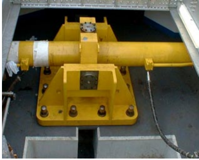
The hydraulic cylinder is mounted to the cardanic ring, which was designed to adapt to the existing footprint.

interlock system at each lock station. This required the operator to reach and manually turn handles until the lock chambers were at the appropriate lockage status. Now, with the hydraulic upgrade, the operator controls the lock from one station, eliminating the need to manually turn the control handles. As a result, there is also a reduction in the