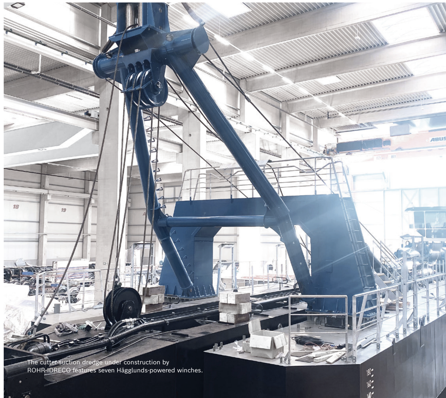
The cutter-suction dredge under construction by ROHR-IDRECO features seven Hägglunds-powered winches.

Bosch Rexroth Netherlands looks set to play a role in gold mining in the near future. The company has supplied seven Hägglunds drive systems to Marotechniek, a winch manufacturer. The drives will power seven winches in an electric cutter-suction dredge on a vessel owned by a Colombian gold mining company. The vessel is under construction by ROHR-IDRECO, a specialist builder of deep-digging dredgers.